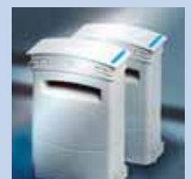
HP Bulk Ink Delivery