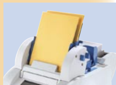
2 sheet feeders and 1 insert/BRE feeder