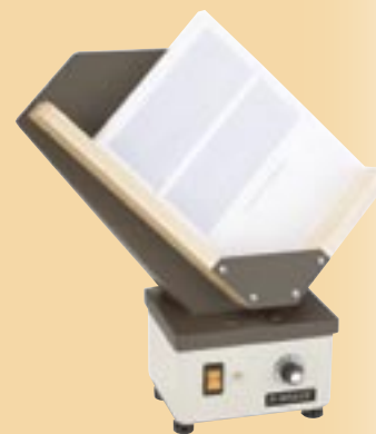
A 400 Series Jogger is a recommended option that reduces static electricity from forms and aligns them for proper feeding